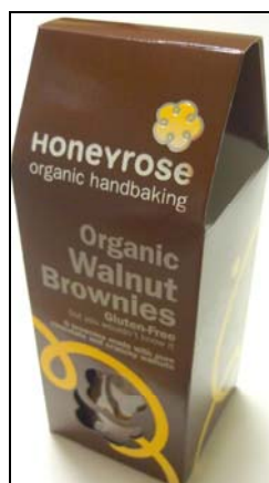
Honeyrose Organic Walnut Brownies, 160g

It goes without saying that we are very pleased to have Sainsbury's as an important customer, and to have gained their confidence in launching our brand across several hundred stores".