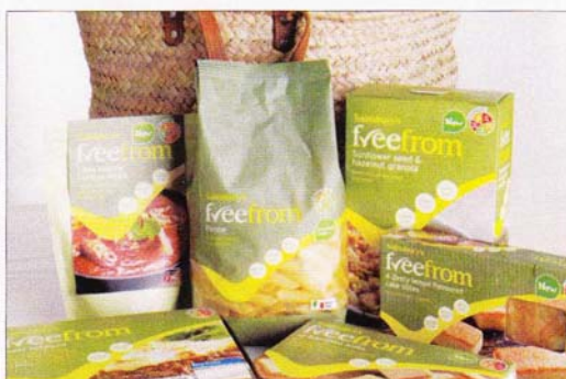
Sainsbury's aims to become the UK's top free-from retailer

"In the dessert area we hadn't really compared fa-