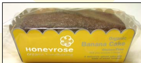
Honeyrose Organic Banana Cake, 300g

Launching at Sainsbury's Feb 18, all gluten-free and organic, by Honeyrose