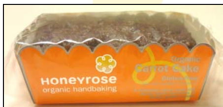
Honeyrose Organic Carrot Cake, 300g